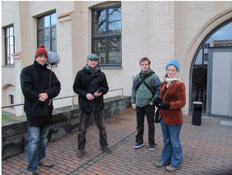
Soundscapes team in front of HMT, 13.11.2010